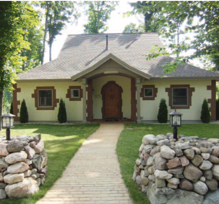
Three on-site, four-bedroom cottages are available for member use. Each includes a screened porch, living room with fireplace, and a charging station for your golf cart.

“I consider it to be your ‘private Idaho.’ We have a no tee time policy, an expert caddie program, and rarely do we have more than 40 members on property,” detailed Mack. “Our double-sided practice facility is world class. We have music speakers built into the ground [usually playing soft rock or country music]; a practice fairway bunker; bunkered target greens; and a separate short game area with natural, raw-faced bunkers that emulate the hazards on the course,” said Mack. “Our bunkers replicate Scottish hazards where sheep had more influence on shaping than bulldozers.”